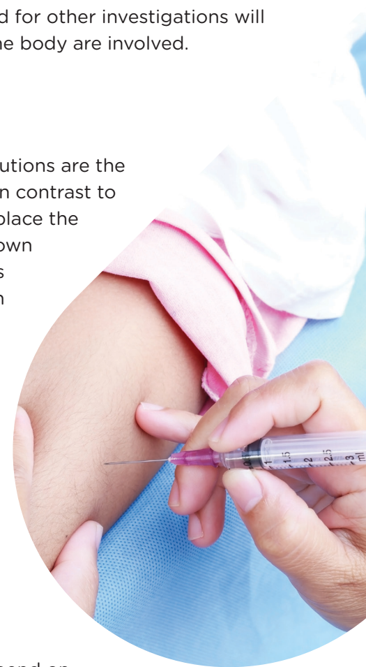
PEG-ADA treatment is given as a weekly injection into a muscle, usually the thigh.

PEG-ADA treatment corrects the ADA and adenosine levels in the blood, and usually leads to gradual improvement and partial correction of immune function. This benefit tends to wear off over a period of years. It can be used until a more definitive therapy is available, such as haematopoietic stem cell transplant (HSCT) or gene therapy. The choice between HSCT or gene therapy will depend on whether there are well-matched donors available